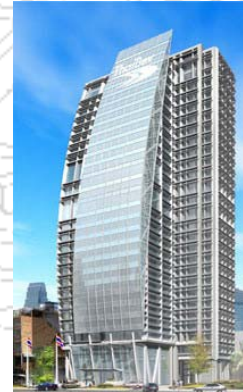
Thai Beverage HQ Office