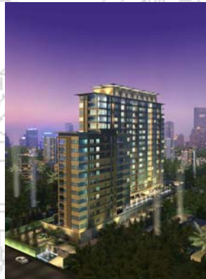
The Lofts, Yennakart

Established in 1999, Warnes Associates has grown in stature to become one of Thailand's leading structural engineering practices, having completed commissions for high rise apartments and offices, industrial complexes, commercial facilities, resorts and spas, specialist facades and sculptural structures, residential estates including infrastructure works, as well as individual high-end residences of all sizes.